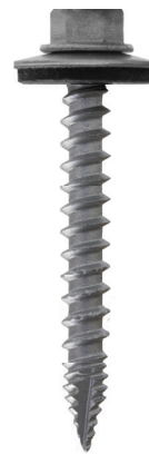
PANEL-TITE® BURR BUSTER SS 304 Stainless Steel